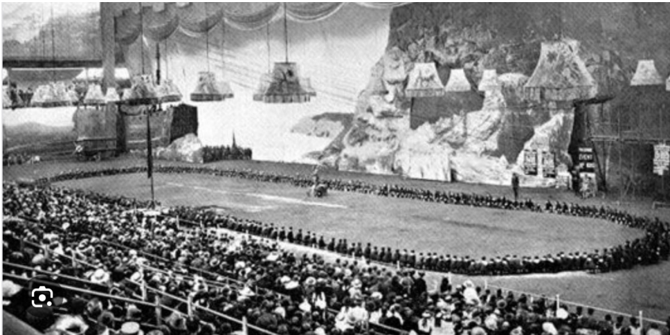
Cubs Grand Howl at the 1 st World Jamboree