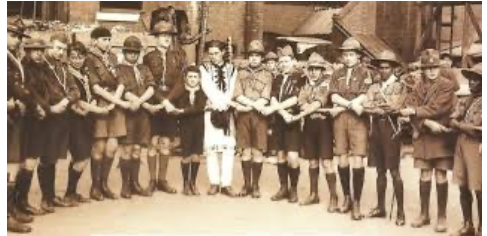
Friendship at the 1 st World Jamboree